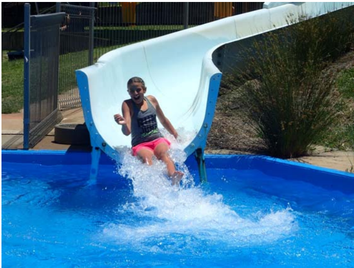
Year 6 Excursion to Narrandera